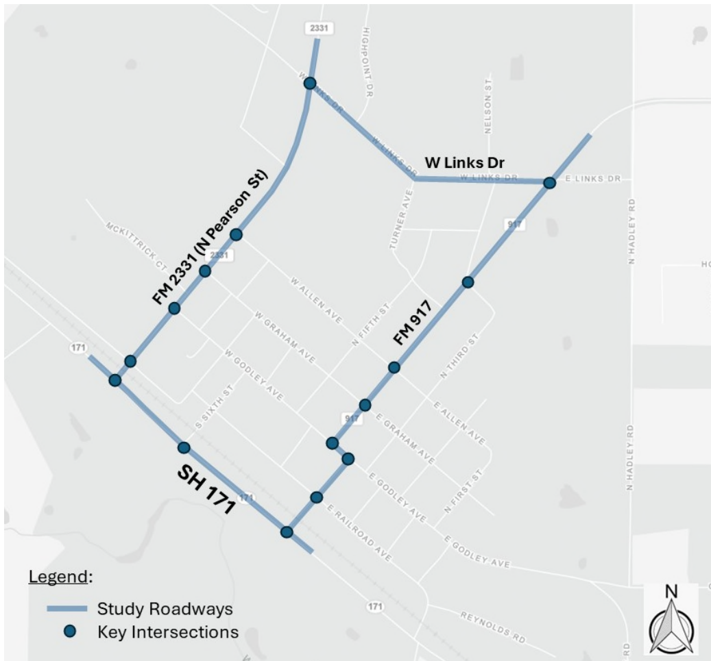
Figure 1. Study Area for Downtown Godley Feasibility Study

The study area will include the segments of SH171 and Links Dr between FM 2331 and FM 917, and segments of FM 2331 and FM 917 between SH 171 and W Links Dr. The study roadway segments and key intersections are shown in Error! Reference source not found..